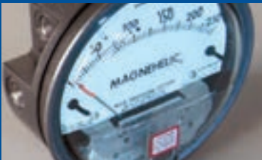
Monitoring gauges & consumables