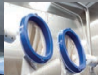
5D Containment Screens