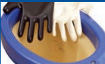
Gloves, gauntlets & gloveports

The failure of component parts can cause costly disruption to production schedules, so it is essential to have quick access to replacement parts.