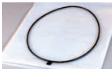
Safe change bags and rings