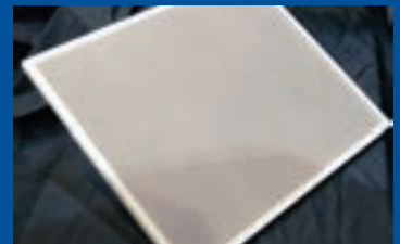
Perfect laminar flow screens