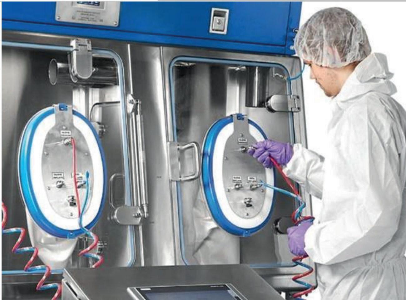
Extract Technology's Multi Port Glove Test Kit

The failure of component parts can cause costly disruption to production schedules, so it is essential to have quick access to replacement parts.